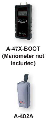
A-47X-BOOT (Manometer not included)